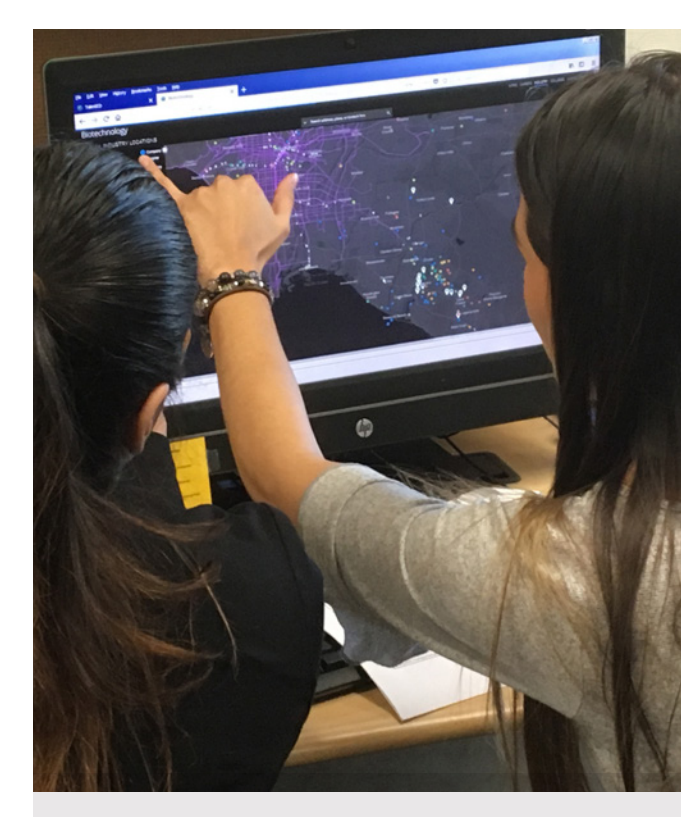
By harnessing the power of GIS technology, TalentED story maps take career exploration to a new level.